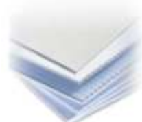
perspex and plastic sheets