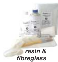
resin & fibreglass